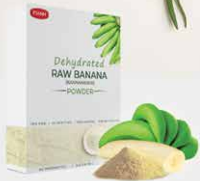
Raw Banana Powder