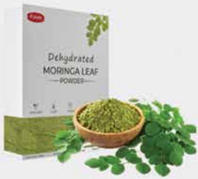
Raw Banana Powder