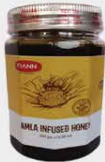
Amla Infused Honey