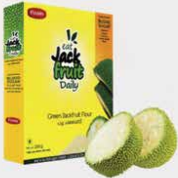
Green Jackfruit Flour